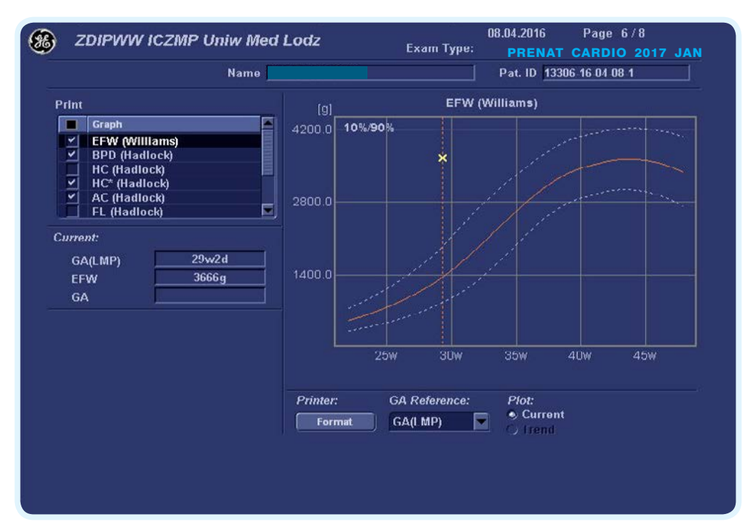
Fig. 1. Fetal biometry