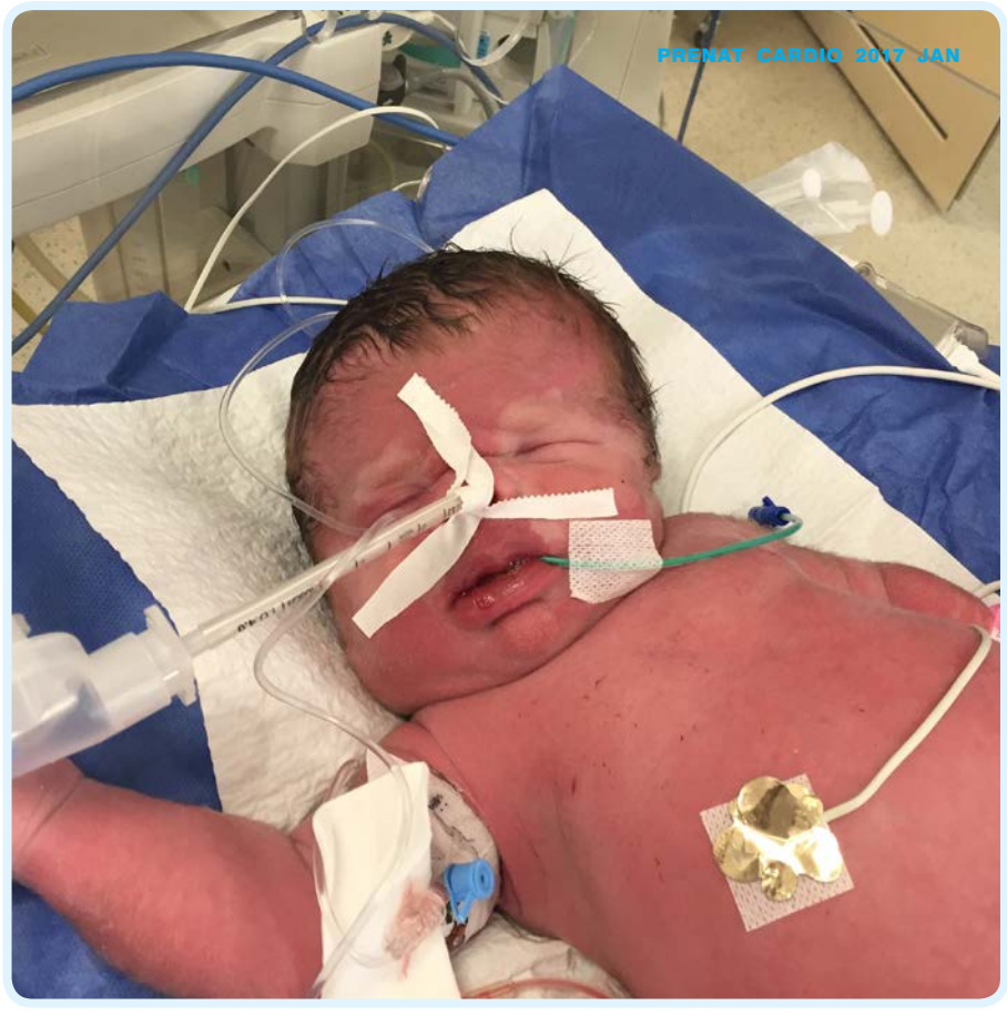
Fig. 9. Neonate in the 1st day after birth (photo thanks to maternal agreement)