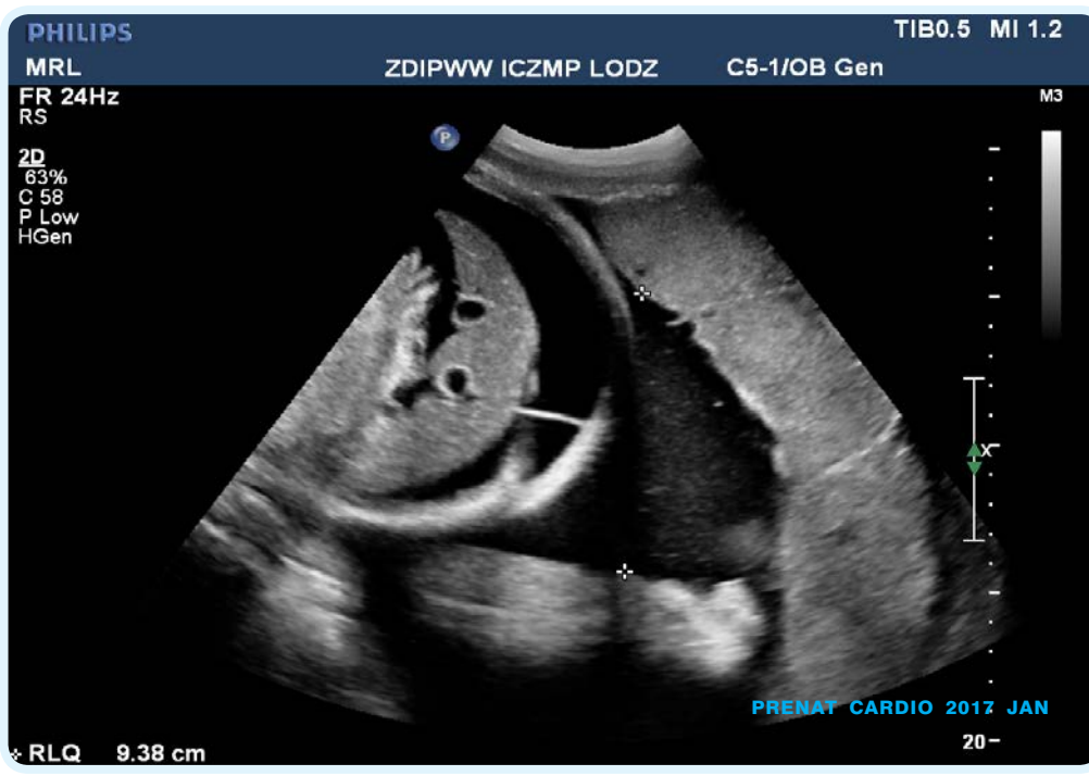
Fig. 7. Fetal ascites at 30 week of gestation and polyhydramnion