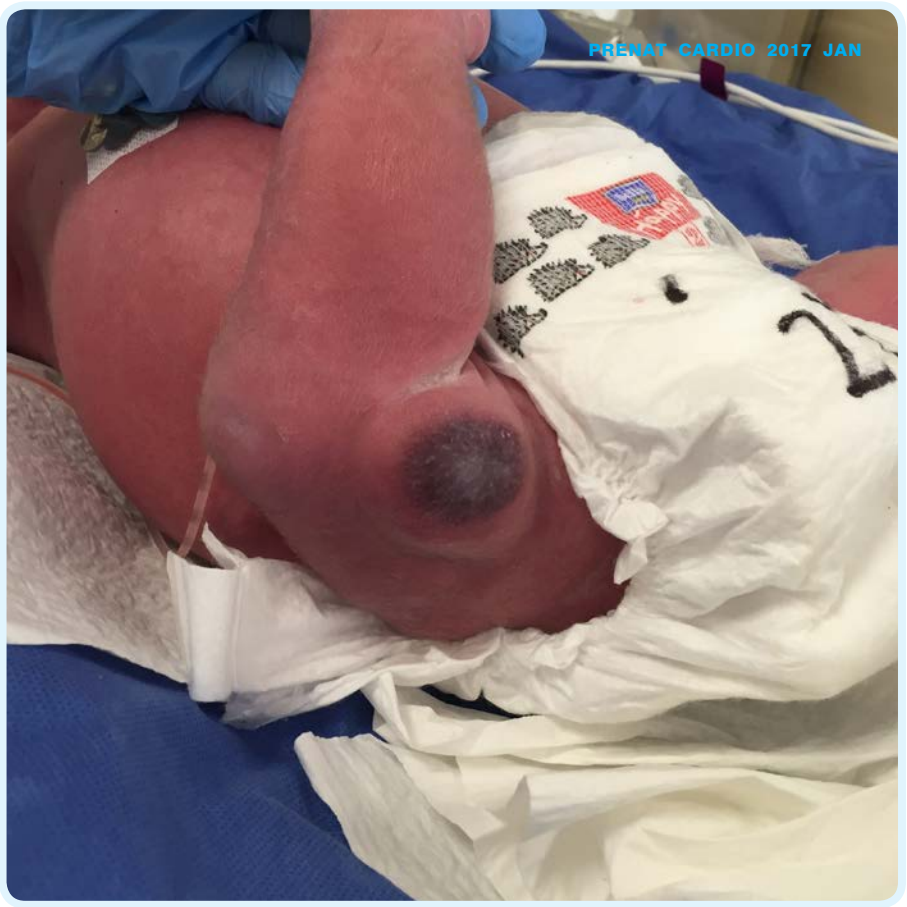
Fig. 10. Neonatal skin tumor in the right leg

vena cava was present suggesting partial anomalous pulmonary venous connection <sup>13</sup> later confirmed by autopsy.