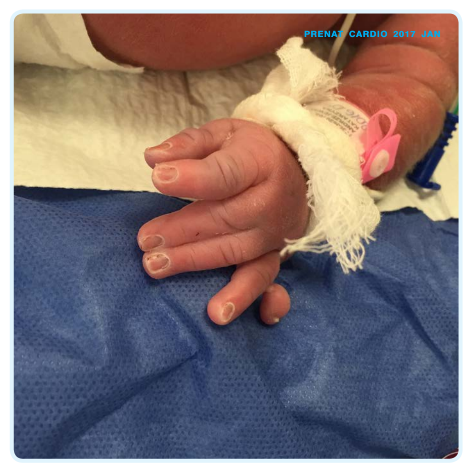
a mutation in HRAS gene does not exclude disorders in the whole RAS gene family (mostly protooncogens). The phenotype of the fetus was most suggestive of Costello Syndrome, but, the most common syndrome in this family of disorders is Noonan Syndrome, usually with an increased NT in the first trimester., In RAS/MAPK signaling pathways an important role is also played by gene NF. This gene acts like a suppressor gene and it can also influence many other genes in the chain KRAS/MAPK, so it can trigger a wide phenotypic variety.