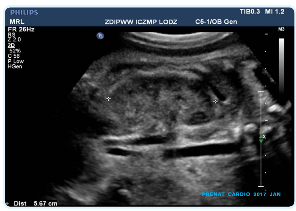
Fig. 8. Fetal large kidney, 56 mm lenght, suggesting visceromegaly